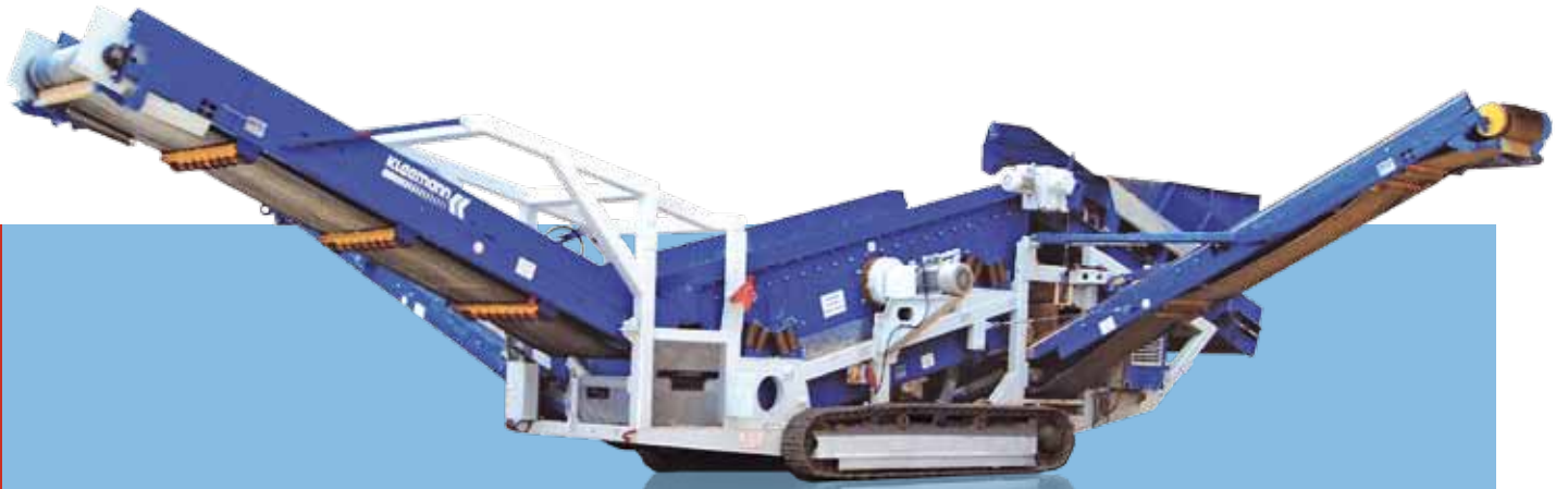
Side view MS 18 Z operating position