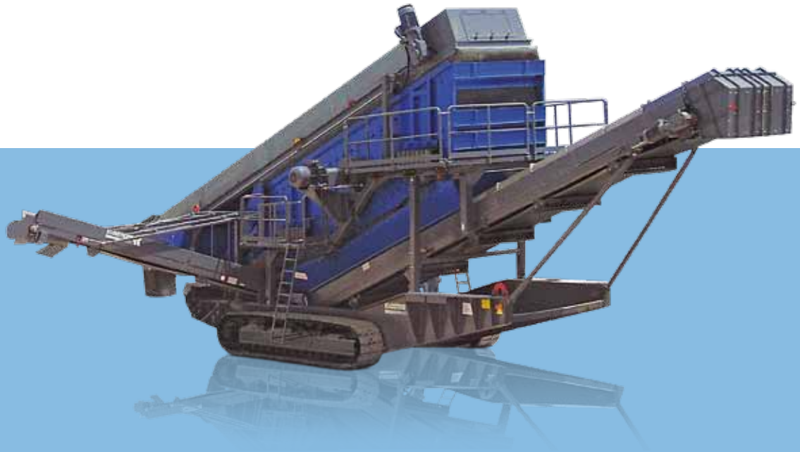
Side view MS 20 D operating position