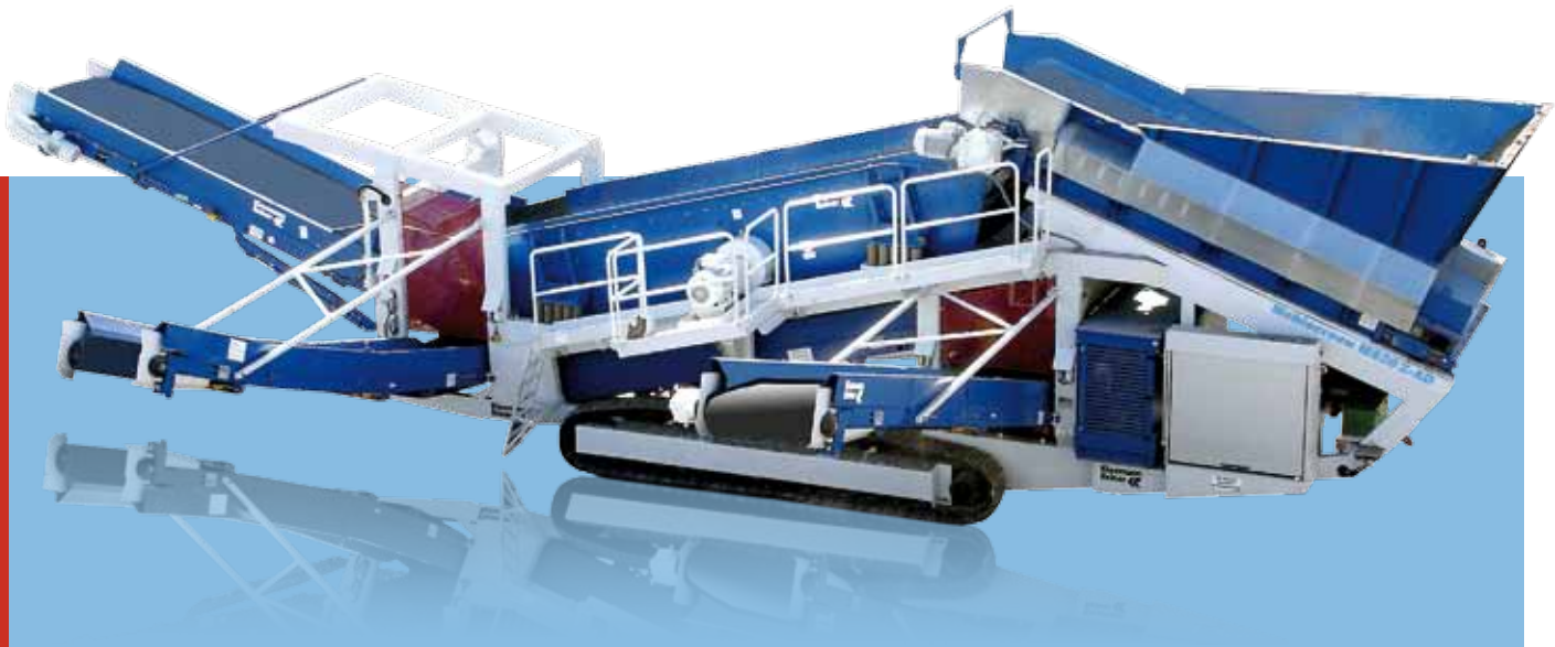
Side view MS 20 Z operating position