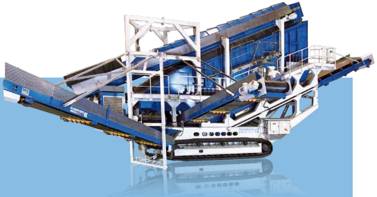
Side view MS 23 D operating position